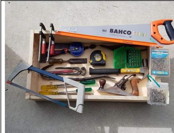
Sample woodworking toolbox: